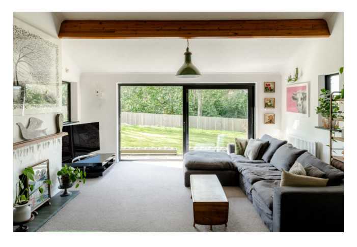
South-East England £1,750,000 Freehold