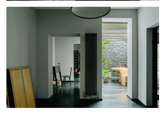
London, West London £3,495,000 Freehold