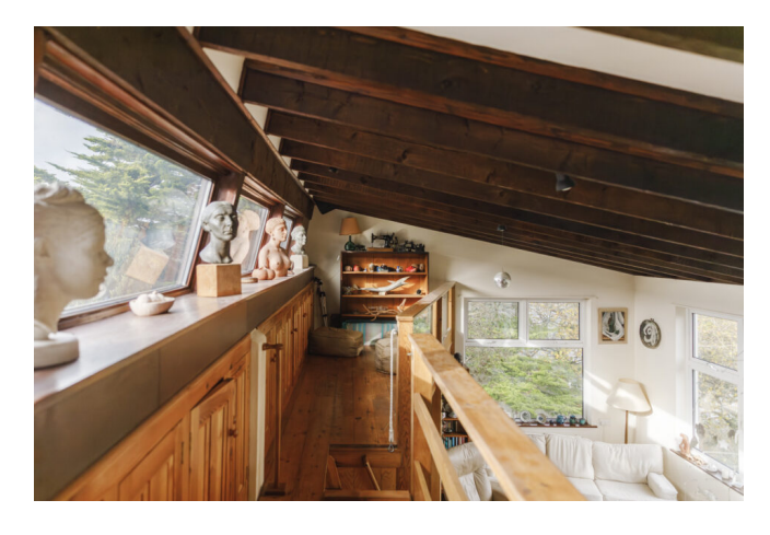
South-West England £975,000 Freehold